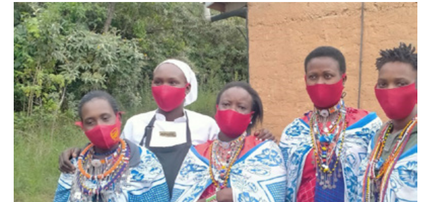
Some Angama women during the campaign

In collaboration with Angama Foundation, Kicheche Community Trust and Community Health Partners we ran a free Human papillomavirus (HPV) self-collection campaign during the month of October. Out of the 88 women who were sampled, 16 tested positive for the virus with the majority of the cases coming from a small town called Aitong. On October 27 th , Dr. Bruce Semo, the campaign's lead Obstetrics/Gynaecologist provided free colposcopies and consultations to those who tested positive. The women who tested negative were counselled to get the HPV vaccine to prevent them from contracting this silent and deadly virus. Dr. Semo also gave free HPV and reproductive health talks to women in Aitong and Angama. Land & Life Foundation takes this opportunity to thank Angama Foundation and Kicheche Community Trust for their support and great partnership! Our goal is to get more women tested and to provide continued support to the communities. We still have the HPV self-collection kits in Angama and Aitong clinics and have advised more women to get tested as soon as possible.