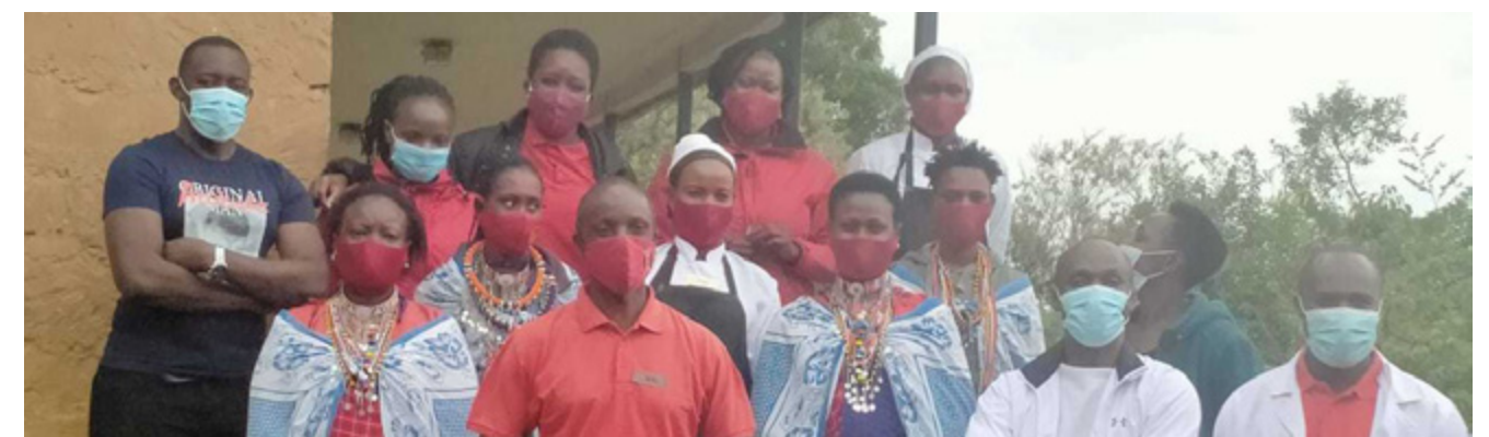
Angama women with the doctors