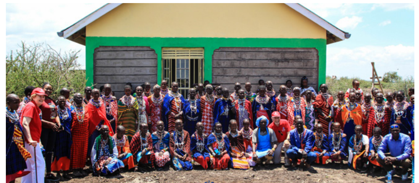
Group photo at the handover ceremony of school projects at Esiteti Primary School