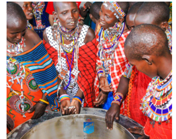
Esiteti women admiring the new stoves