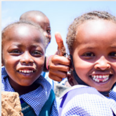
Background photo ©Pie Aerts