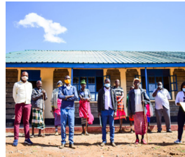
School committee outside the new classroom at Morijo Primary

Under the banner of our Pamoja Fund COVID Response Initiative, we also donated 30 handwashing stations each with a 120 liter capacity, 1,566 reusable face masks for teachers and students, nine thermo guns, 120 litres of handwashing liquid soap, 20 litres of toilet detergent and 30 soap dispensers to Ura Gate, Kachiuru and Ololomei Primary Schools.