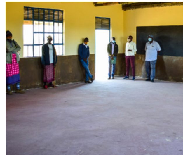
School committee inside the new classroom at Morijo Primary